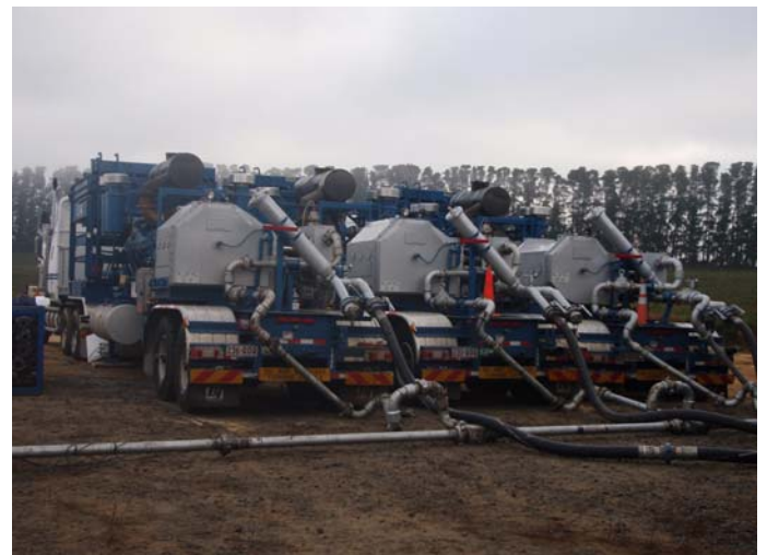
BJ frac pumping trucks on site at Wombat 2 in June 2009