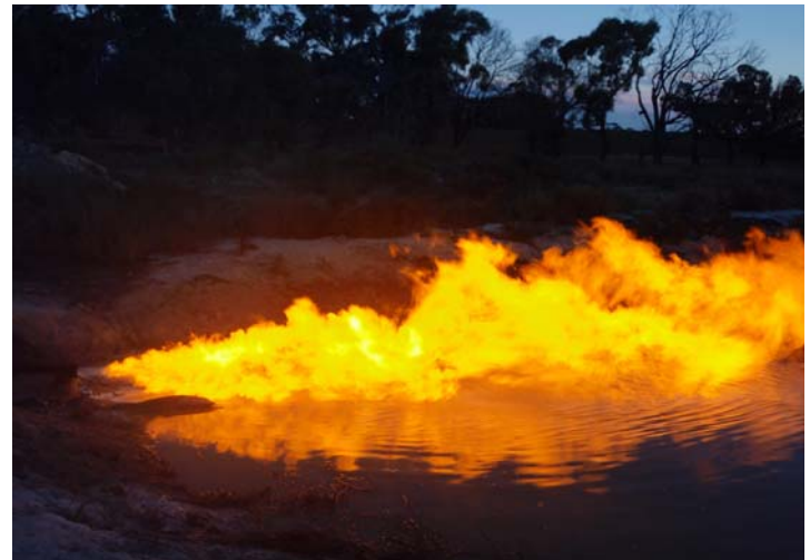
Wombat 2: gas flare during clean up operations in July 2009

The well bore pressure builds up rapidly during each shut-in operation, indicating that there is good communication between the well bore and the formation, confirming the effectiveness of the re-fracturing.