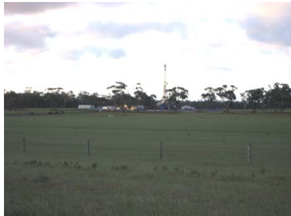
Wombat 4 – drill site near Seaspray