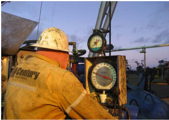
Wombat 4 – driller on rig floor

At the time of writing, Wombat 4 was at 1366 metres KB and pulling out of the hole for wireline logging. The main target is tight gas sands in the Strzelecki Group, which is expected within the next 20-30 m. The proposed total depth is 2000 metres.