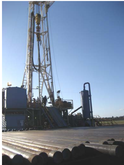
Wombat 4 – Hunt Rig #2